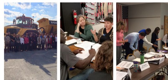
LC CIRCLE RECRUITMENT EVENT

Know someone who would be interested in joining Leadership Cumberland? Join us at our annual LC Circle! Come meet our leaders and learn about the life-changing experiences Leadership Cumberland provides from a few of our current Fellows. They'll share their testimonies and takeaways as well as some class accomplishments.